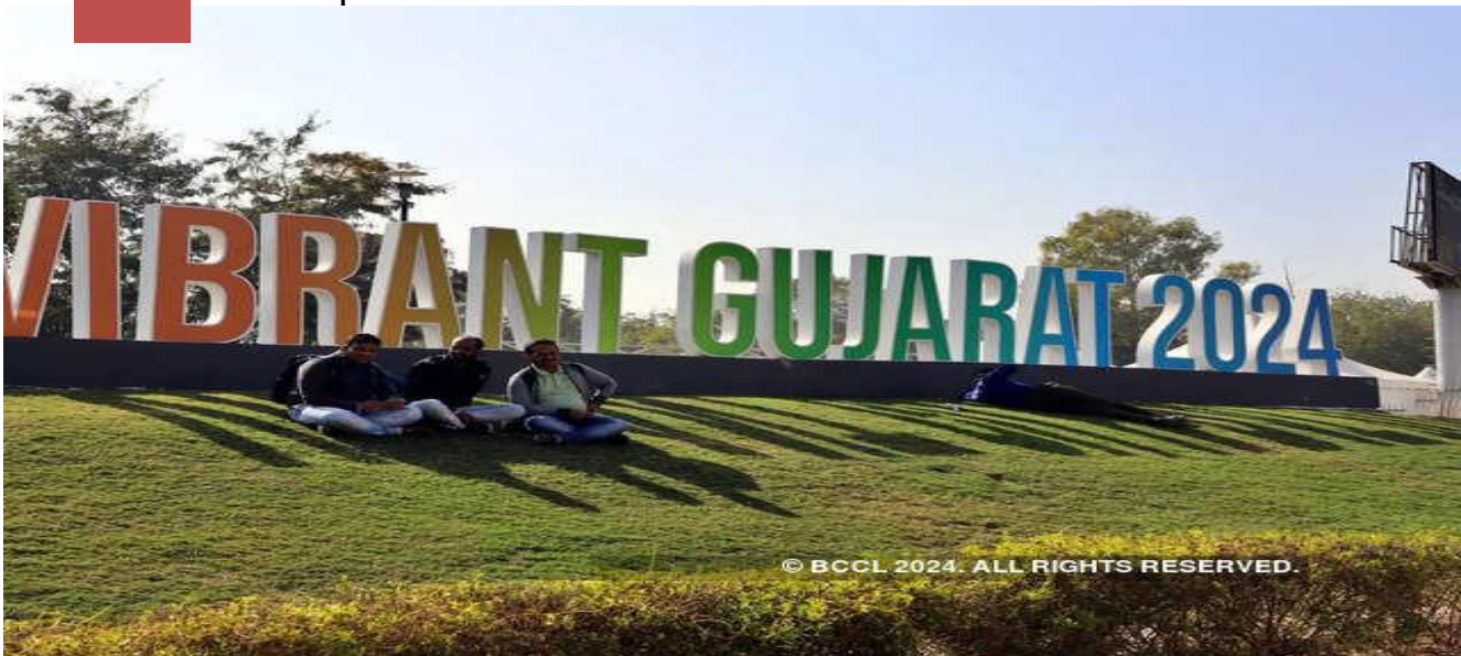
(A) Vibrant Gujarat